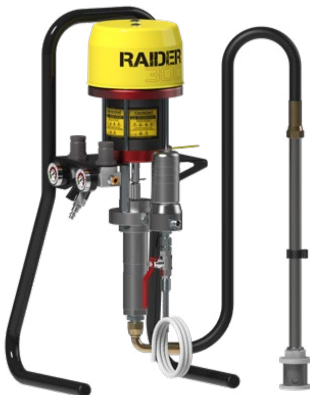
Trolley and absorption version

Within the quality standards we focus on simplicity and durability . Thus, we have redesigned completely the hydraulics. Now it contributes to a long-lasting life even in the worst working conditions and without waiving on its performance.