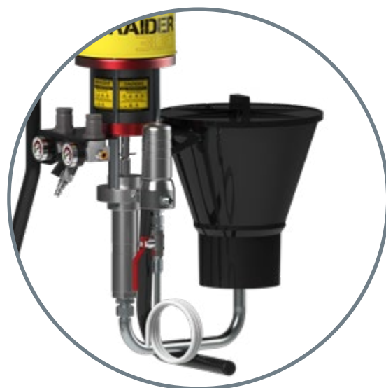
Trolley and deposit version