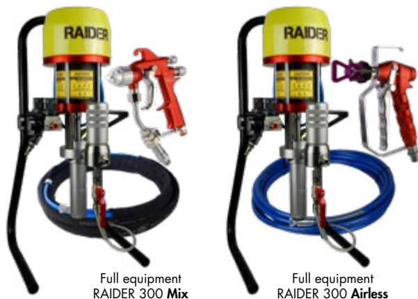
Full equipment RAIDER 300 Mix